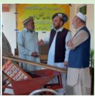
Distribution of Agriculture Tool Kits of the Virus Free Potato Seed to Growers/Farmers of District Kurram under AIP Scheme.