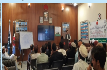
Two days' workshop on Olive Promotion , Olive Cultivation and Top Working was conducted in Ghiljo and Kalaya District Orakzai with the support of Orakzai Scouts under the Project" Promotion of Olive Cultivation in Merged Areas"