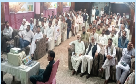
DDA Haripur, Pro-vice chancellor university of Haripur and president model farm services center Haripur addressing Stakeholders Workshop to sort out problems for low yield of Wheat Crop and recommend solutions to enhance wheat crop under Agriculture transformation project.