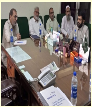
The high delegates of National Disaster Risk Management Fund (NDRMF) and World Bank (WB) visited Directorate General Agriculture Extension and Directorate General Agriculture Research Khyber Pakhtunkhwa to discuss the on ongoing project activities under Climate Resilience through Horticulture Interventions in Khyber Pakhtunkhwa.