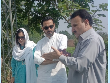
National Disaster Risk Management Fund (NDRMF) Islamabad office delegation visited Tribal District Khyber on 12<sup>th</sup> October 2022. They inspected various activities i.e., Saffron Cultivation, Fruit Nursery Farm, Off-season Vegetable Cultivation, Tunnel Technology and Model Citrus Orchards.