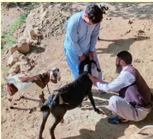
Sampling for brucellosis at District Haripur & Dir Lower are in progress and facilitated the farmers for pregnancy diagnosis through ultrasound in their goats by Livestock Research Department team.